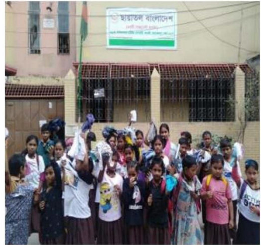
Photo: Eid Cloth Distribution

On May 19, Eid clothes were given to the children of three campuses in anticipation of Eid-ul-Fitr. The children were happier to get new dresses. On the same day, a clothing distribution program was held among the children of three campuses.