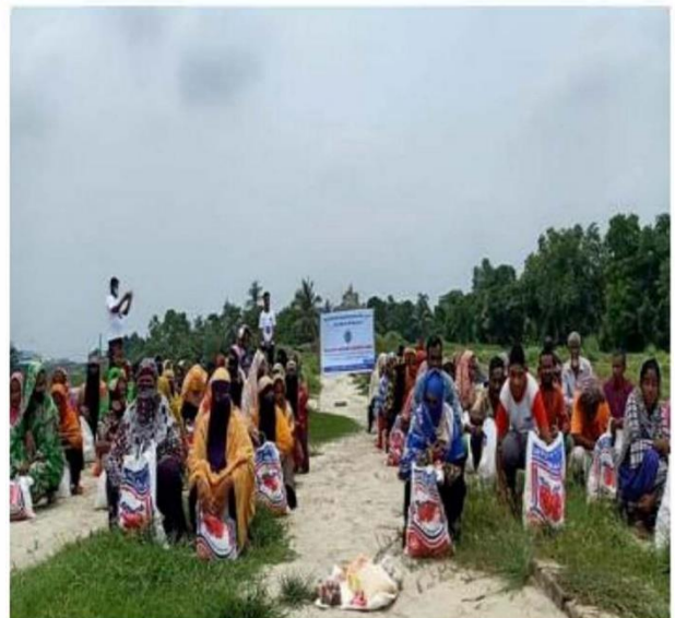
Photo: Food distribution

During the global corona virus outbreak and the lock down announced by the Bangladesh government, people who work in different areas, such as day laborers, became inactive. Consequently, these workers led their life very hardly with their families. Food items for one week were distributed to more than 2000 families in several stages in April to stand by the helpless people in this difficult time in different parts of the country.