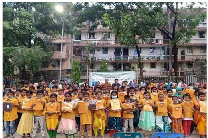
Photo: School uniform distribution

On March 30, Ananda mela Los Angeles, an American donor organization, distributed school uniforms to the 113 children of Chayatal Bangladesh.