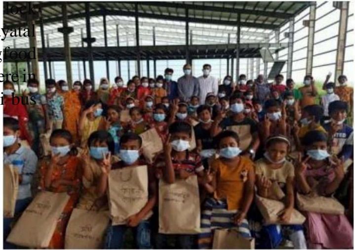
Photo: Cloth distribution before Eid

On July 6, due to the long-term lockdown, at night, Chayatal Bangladesh helped by distributing food to the transport workers, who were in need of the food crisis in Gabtoli bus terminal.