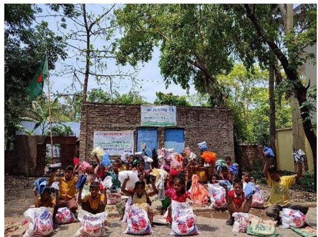
Photo: Food distribution for Eid

Due to Eid-ul-Fitr, in the same month, the Eid commodities were distributed among the children of Chayatal Bangladesh. This is a small effort of Chayatal to share the joy of Eid.