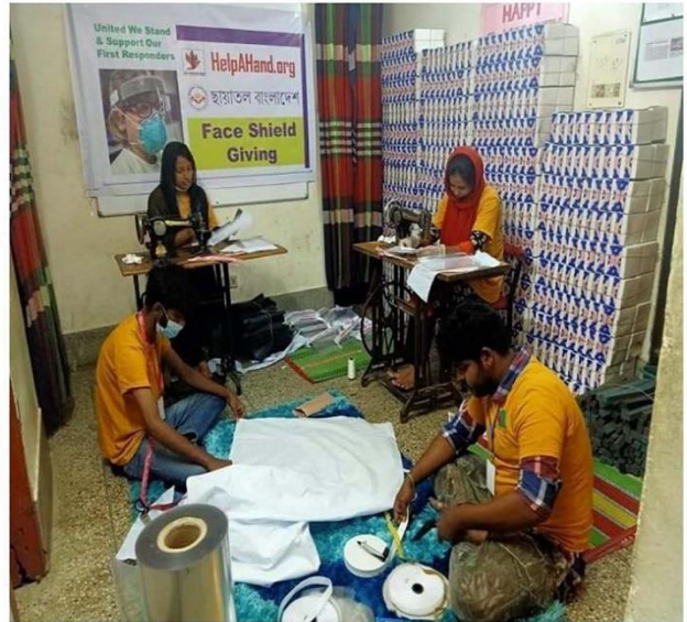
Photo: Face shields making

During the global spread of the corona virus, the volunteers of Chayatal Bangladesh made face shields and delivered them to different hospitals to stand by the doctors and health workers engaged in the treatment of corona virus infected patients in Bangladesh. This activity started on March 10.