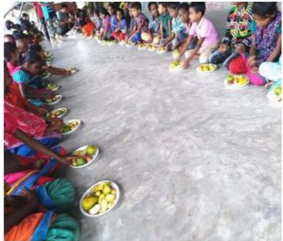
Photo: Fruit Festival

On March 10, we celebrated the fruit festival with children. They are happy to eat seasonal fruits. Each child was fed a mango, apple, banana, guava, latkon, litchi, and a few ripe jackfruit cells. We celebrate the fruit festival with children every year in March.