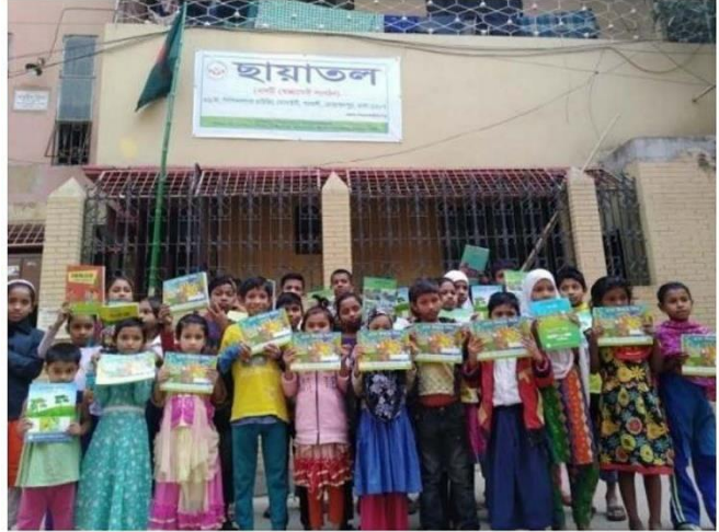
Photo: Distribution of Storybooks

In January 2007, the storybooks were distributed among children. Children are encouraged to read these books along with government textbooks sent by the Bangladesh government. We continue to take steps to help children acquire external knowledge beyond textbooks.