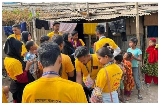
Photo: Inquires on burning slum

On November 27, the volunteers inquired about the underprivileged children at the burning slum area in West Agargaon. The main motives of the campaign were 'Improving Children's Quality of Life and Health Awareness.'