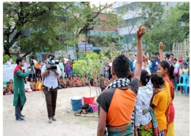
Photo: Cultural program

As part of the entertainment aimed at children's mental development, an interesting cultural program was organized at Shyamoli Chayatal Corner on the occasion of the Great Independence Day on March 26. In sometimes we have organized such programs.