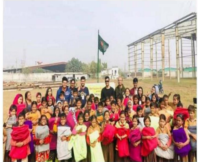
Photo: Blanket distribution