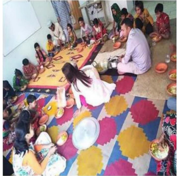
Photo: The moment before eating

This is a view of the noon of September 15th. At the end of every class, we try to feed the children a full meal. From the beginning, we served food to children on clay plates. Considering children's nutritional aspects, we include a sufficient amount of vegetables and small fish in the food list. To reduce the cost of food, we market ourselves and cook in the office of the organization.