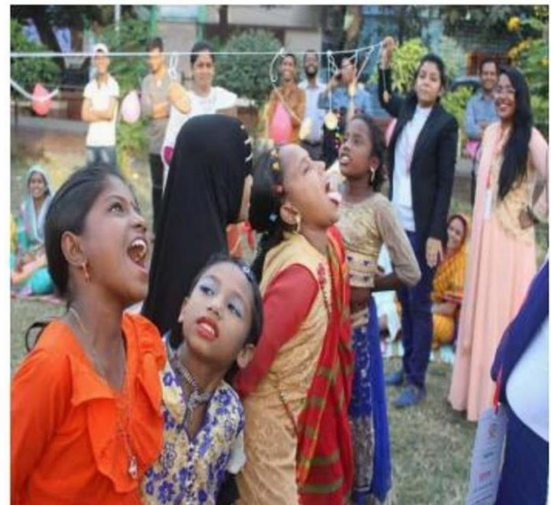
Photo: Annual sports competition

On December 24, after the end of the annual examination, the annual sports competition program was organized for the children. Games like the children's race, frog jump, biscuit race, cockfight, etc. were organized. Prizes were awarded to the 1st, 2nd, and 3rd place winners.