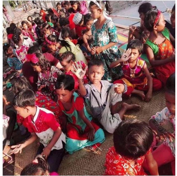
Photo: Mehdi festival