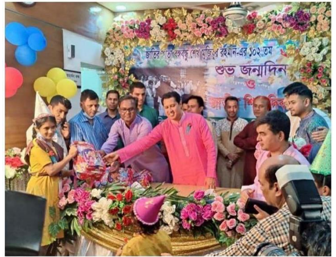
Photo: School bag distribution