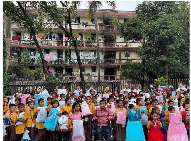
Photo: Eid cloth distribution

At the end of April, Eid clothes were given to the children of three campuses in anticipation of Eid-ul-Fitr. The children were happier to get new dresses. Chayatal. Members of the adviser council, well-wishers, and volunteers attended at the 'Cloth Distribution Festival'.