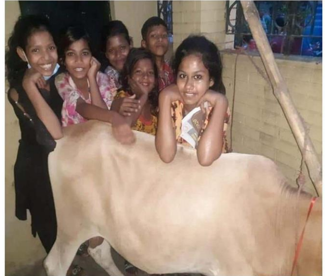
Photo: Qurbani's Cow with children

On August 1, we got a cow as a gift to the children on Eid-ul-Adha. On the Eid day the beef were distributed among all the children of the organization. Every year we distribute beef and mutton among the children.