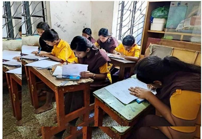
Photo: Final Examination

From November 18 to 29, the final examination of all the campuses were end successfully. Assessment of children through examination and a class-based teaching system continues in this organization. After verifying the quality of the children's education, passed children are allowed to their own classes.