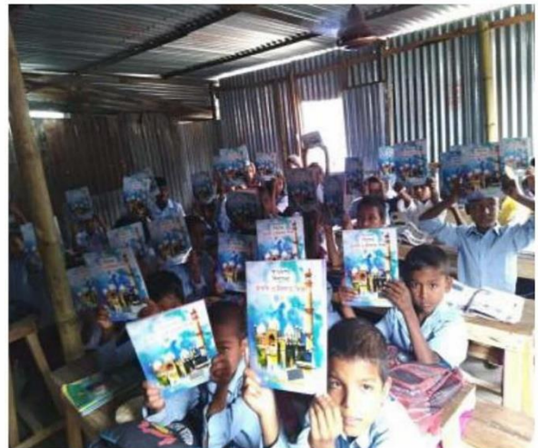
Photo: Moral ethics book distribution

Moral ethics books were distributed among all children according to their respective religions to teach moral education to children. Most of the volunteers of Chayatal Bangladesh were present on that program. It was observed that all the children were excited to get the new book.