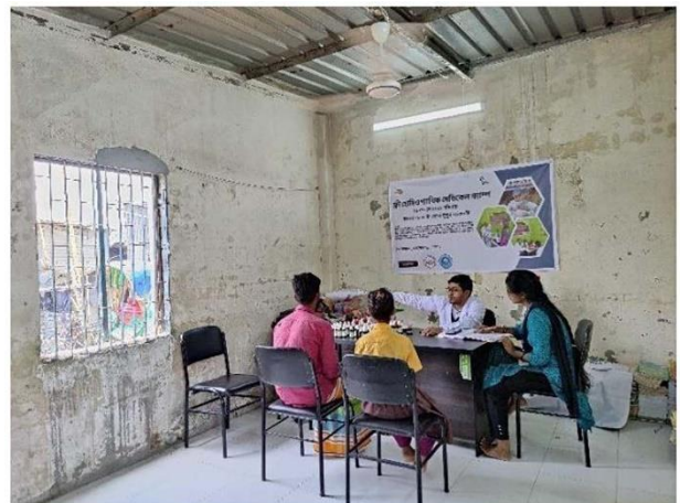
Photo: Homeopathic medical camp