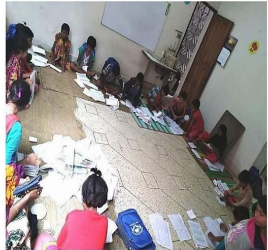
Photo: Thong-making training

As several children of the organization were involved in begging, the organization trained Campus 1 and the children in making thongs from waste paper. So we are continuing our efforts to move these children away from begging and into activity. The thong-making training began on September 13, 2017.