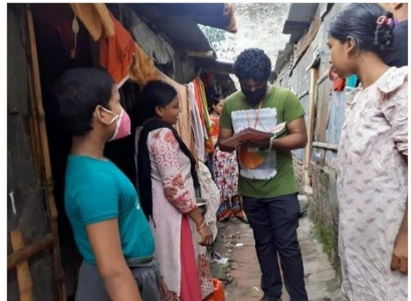
Photo: Info collection at Kalyanpur slum

On December 8, volunteers from Chayatal Bangladesh made a small effort to find out about the distressed and helpless people in the Kallyanpur slum and provide them with a handful of food.