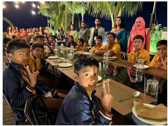
Photo: Attended wedding ceremony