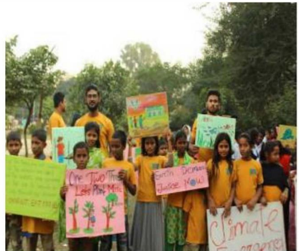
Photo: Human-chain against climate Change

On the 25th of July, children and volunteers of the organization formed a human chain to inform the general public about the harmful aspects of climate change. Children with different placards and festoons in the human chain attract everyone's attention. Everyone applauded this type of movement with the children.