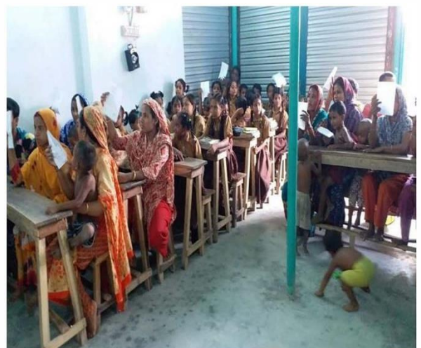
Photo: Guardian's meeting

On March 7, a meeting was occurred with the guardians of campus II of Chayatal Bangladesh and the meetings were held in Campus I and Campus III on March 10 and 12 respectively. The volunteers tried to convince the parents from their respective places to explain the importance of education.