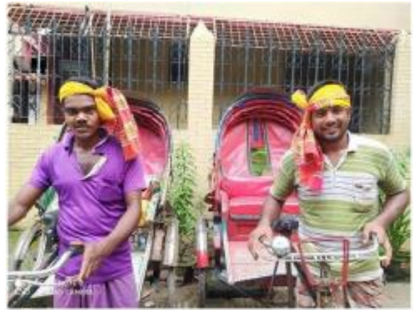
Photo: Rickshaws distribution