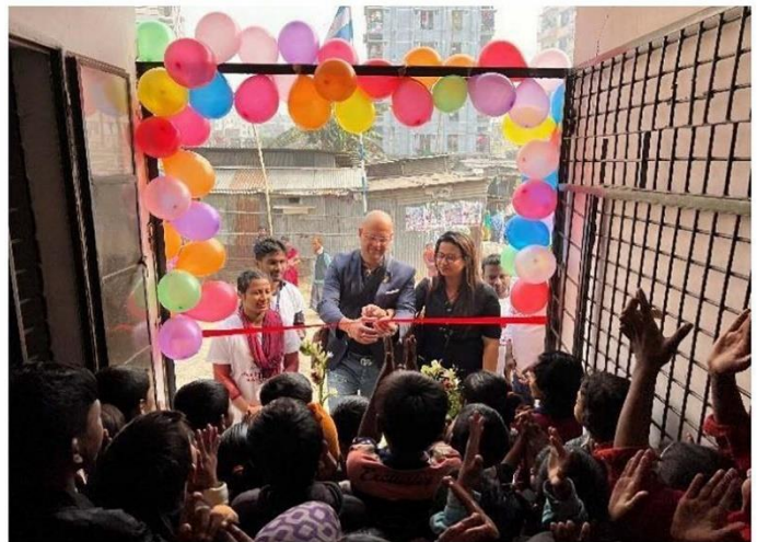
Photo: Launching Campus IV

On December 30, we launched the new Campus IV with the assistance of the Toronto Indian Youth Cultural Association (TIYCA).