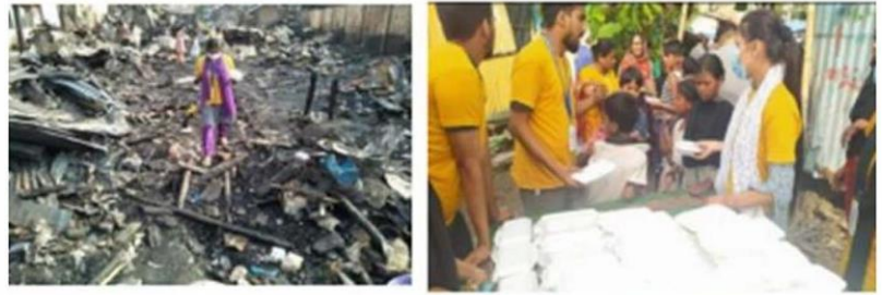
Photo: Food distribution in the burning slum

On the 24th of November, in Mohammadpur's Jahuri Mahalia, in the burning slum, food, clothes, utensils, tin, bamboo for accommodation, etc. We were distributed to the helpless people by Chyatal Bangladesh.