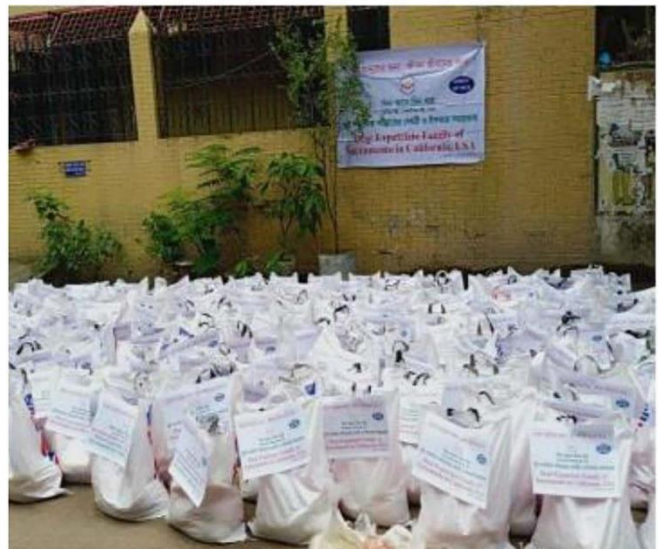
Photo: Package of foods for poor

We have continued the relief distribution program with the help of various donor organizations to stand by the distressed and helpless families. In continuation of this, in front of the office of the organization, on the occasion of National Mourning Day on August 15, we distributed 1-week food packages to 200 families.