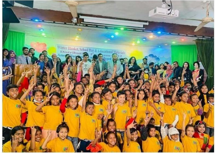
Photo: Winter cloth and educational materials distribution