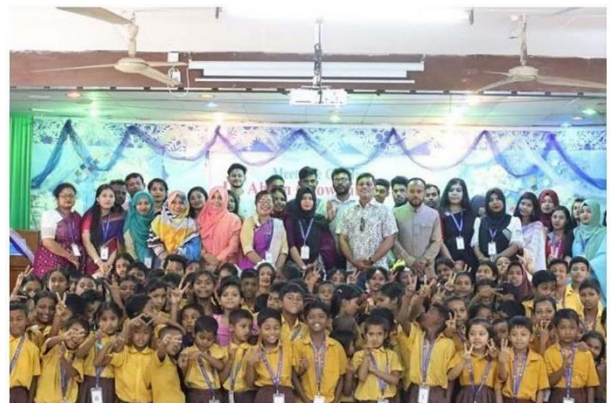
Photo: Cultural Program