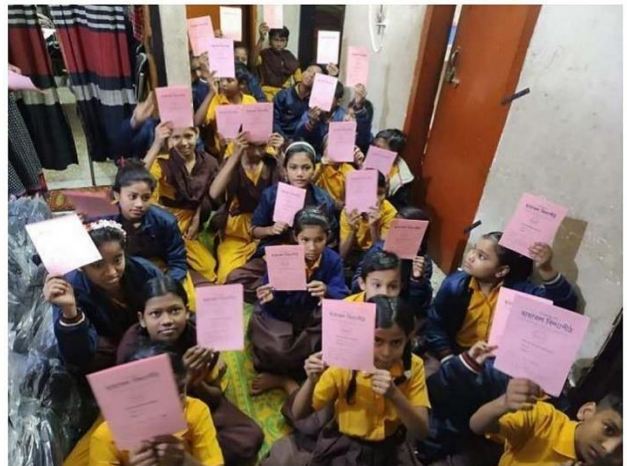
Photo: Result publishing

On December 07, the final examination result was published among three campuses. All the passed students were allowed to join the next class. Prizes were given to first, second and third place students in all classes through the publication of branch-wise results.