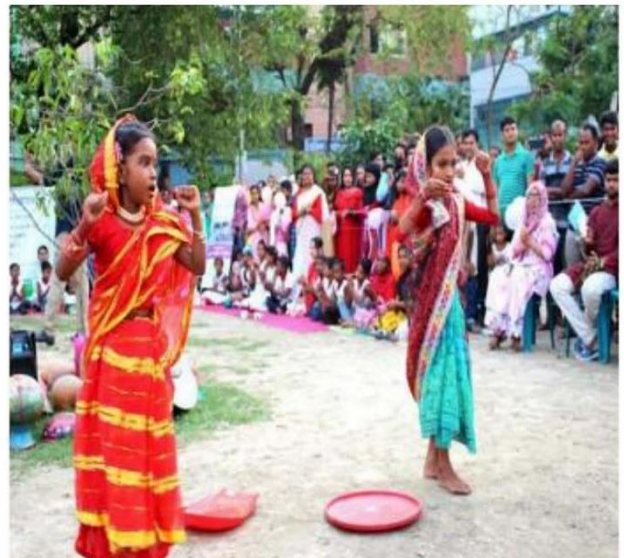
Photo: Cultural program

A colorful cultural program was organized on July 25 at Shyamoli Park Chayatal Corner as a part of the entertainment aimed at children's mental development. Sometimes we continue such arrangements on behalf of the organization.