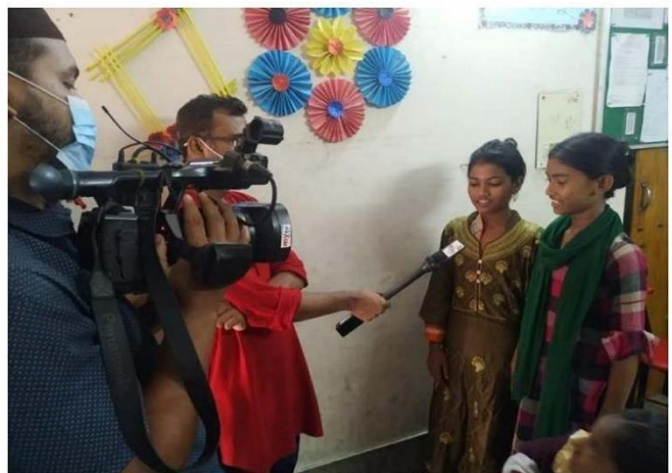
Photo: Interview in MY TV

On May 15, the children of Chayatal were interviewed in the program "Children's Eid Anando" on satellite television, My TV.