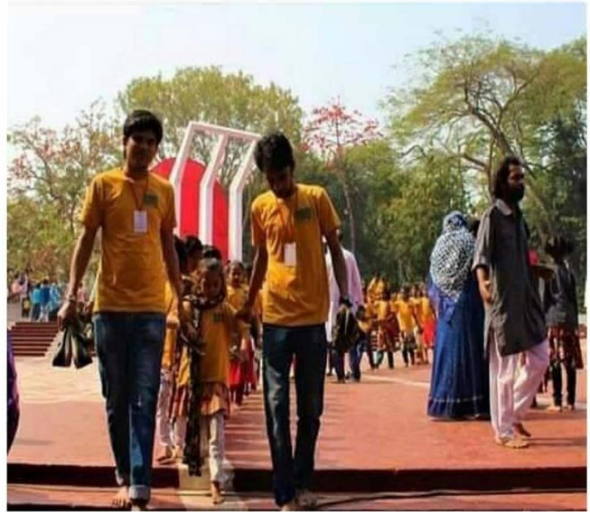
Photo: Children in front of Central Shaheed Minar

On October 16, all the children visited the Central Shaheed Minar to learn about the language movement. A director of the Bangla Academy. All volunteers from Jalal Ahmed and Chayatal Bangladesh organizations were present during the visit with the children.