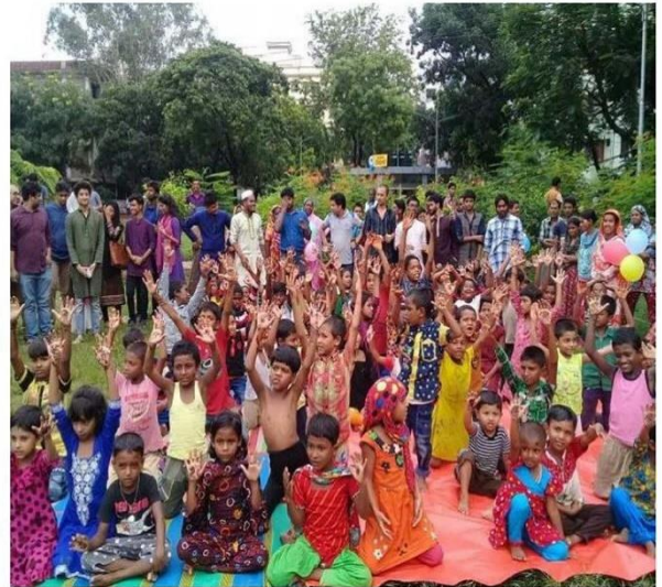
Photo: The moment before cloth distribution

On May 25, the clothes were distributed among hundreds of children of the organization for the 'Eid festival'. Some of the well-wishers and all the volunteers attended at that time. The program was organized from 4 p.m. to 6 p.m. The cloth distribution program was held at the Chayatal Corner of Shyamoli Park in Dhaka.