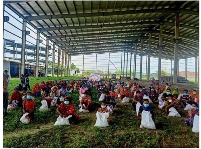
Photo: Food Distribution

On May 9, Chayatal Bangladesh distributed foods and commodities to the two hundred families with the assistance of expatriate Bangladeshis in Sacramento, California, America