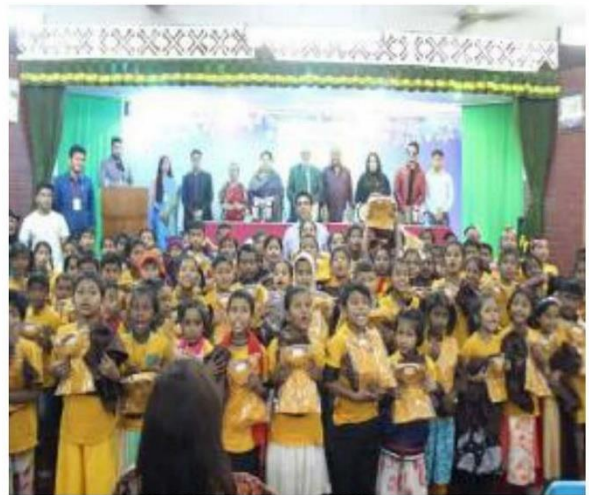
Photo: School uniform distribution