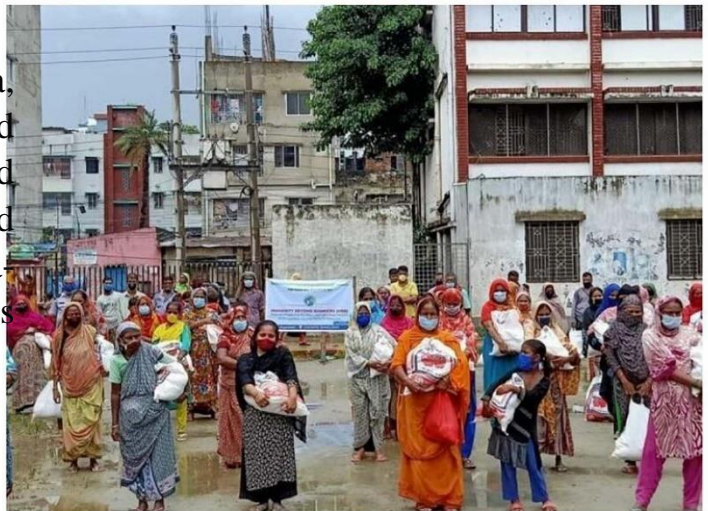
Food distribution

On July 18, due to the Eid-ul- Adha, Chayatal Bangladesh provided food support to hundreds of poor and unemployed family. This food distribution was completed in area Dip Nagar, Parbatnagar, and Darus Salam area of Dhaka.