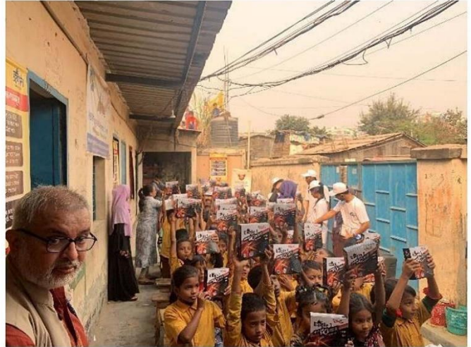
Photo: Dengue prevention campaign.

On December 5, we organized a workshop on dengue prevention for the underprivileged children through the initiatives of the 'Eagle Mosquito Coil', the brand of Kazi Enterprises Ltd. The name of the workshop was "Be Aware, Stay Safe."