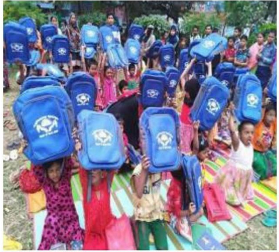
Photo: School bag distribution

At the beginning of the year, on January 5, school bags were distributed among the children of the organization. They were happier to get new books along with school bags and materials. A school bag and educational items distribution program was held at the Chayatal corner of Shyamoli Park.