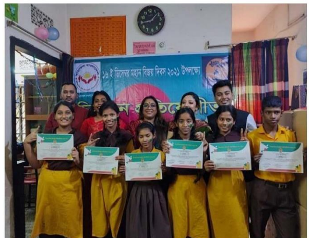
Photo: Annual drawing competition

On December 16, due to the Victory Day of Bangladesh, Drawing competitions and prizes are distributed among the children of Chayatal to develop their creativity and intelligence.