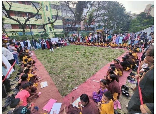
Photo: Drawing competition

On August 15, we arranged a drawing competition for all the children at Shyamoli Park. At the end of the competition, we organized a prize-giving ceremony and a "Hari Vanga" game. For the development of the talent of the children and to make them familiar with our old traditions, we made these small efforts.