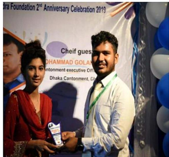
Photo: Received honorarium mement