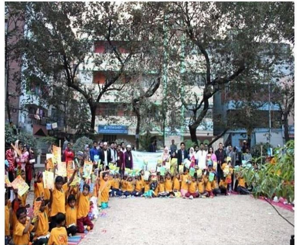
Photo: Book distribution program

On January 1, the books received by the Bangladesh government were distributed among the 113 children on the three campuses of the organization. The book distribution program was held at the Chayatal corner of Shyamoli Park in Dhaka. The program was organized from 4 p.m. to 6 p.m. Some dignitaries of society and the volunteers of Chayatal Bangladesh were present on that program. Books had been distributed among the 45 first graders, 41 second graders, and 27 third grade students. It was observed that all the children were excited to get the new book.